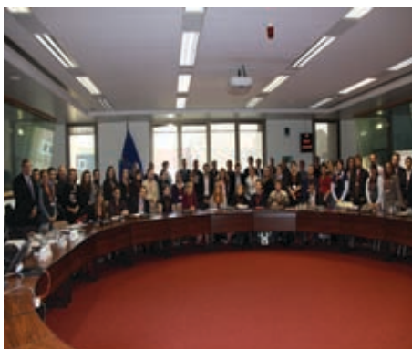
Group picture with all students

Following the success of previous events, the FVE, DG Sanco and its partners 1 are now preparing the next EU Veterinary Week, which will be held in Brussels on 19 and 20 May 2011. The overall theme will be the role of veterinarians in society, while the conference will focus on crisis management and vaccination policies.