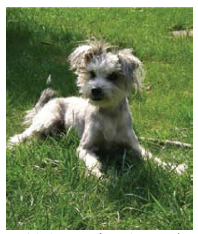
Tail docking is performed in puppy's without anaesthesia or pain relief.

Tail docking is the term used to describe the shortening an animal's tail by amputation, undertaken when the dog is a puppy, without anaesthesia or pain relief. Most dogs are docked for cosmetic reasons. Tail docking is considered to be an 'act of veterinary medicine' that can only be legally performed by registered veterinary practitioners - and under the ethical code of the Veterinary Council of Ireland, veterinary practitioners are prohibited from performing 'purely cosmetic' procedures. Performing a tail docking for cosmetic reasons could therefore leave a veterinarian open to disciplinary action.